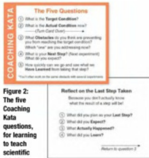
Figure 2: The five Coaching Kata questions, for learning to teach scientific thinking. (Illustration from "Toyota Kata Culture," NY: McGraw Hill, 2017.)

The Improvement Kata pattern starts with a challenge, a direction for improvement that matters to the organization (see Figure 1). This leads to study of the current condition at the learner's particular gemba. Often, this leads lean practitioners to immediately list problems that need to be solved and develop a list of countermeasures assigned to different people, but that is not scientific thinking. Instead, the Improvement Kata has the learner first establish a next, closer in "target condition" for their focus process, in the direction of the challenge, with an achieve-by date between one week and one month in the future. Then the learner starts identifying obstacles to that target condition and begins to experiment against those obstacles, one by one, to iteratively move toward that target condition.