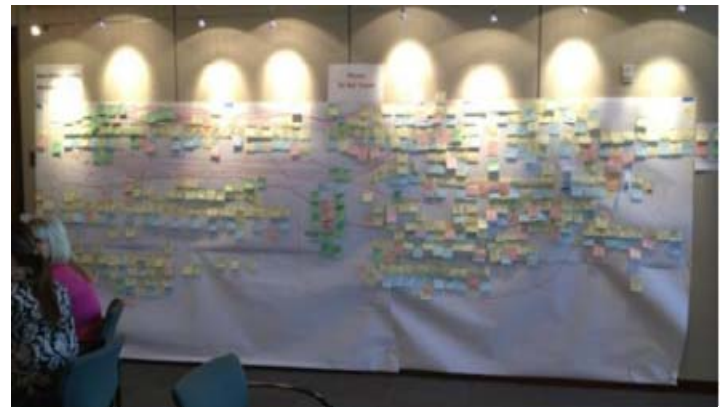
Kitsap County's single family residence permit process before (top) and after (bottom) its Lean review.