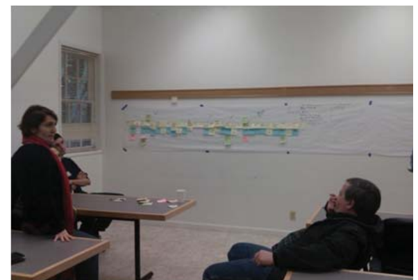
Island County employees brainstormed ways to improve their processes.